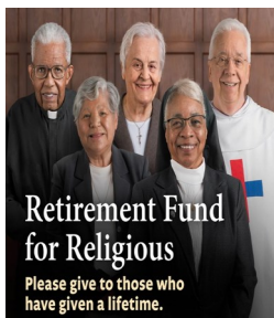
Retirement Fund for Religious Please give to those who have given a lifetime.

Please donate to the Retirement Fund for Religious next week. Your gift will provide essential care for nearly 25,000 senior sisters, brothers and religious order priests who have dedicated their lives to serving others. Let us show our gratitude to these selfless individuals by giving generously.