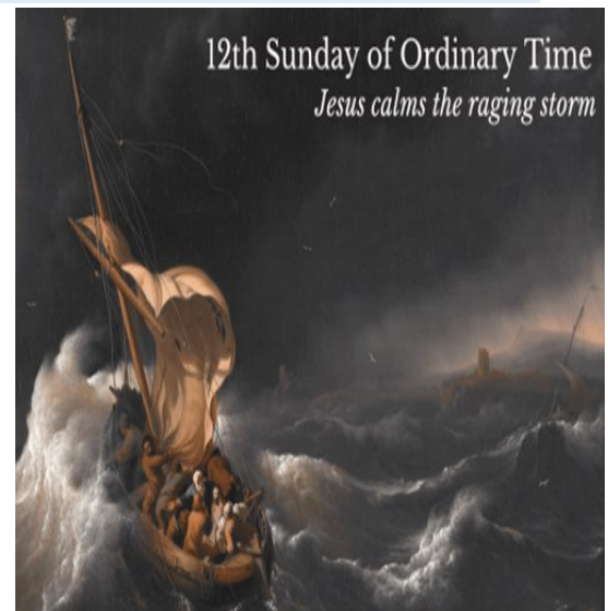
12th Sunday of Ordinary Time Jesus calms the raging storm