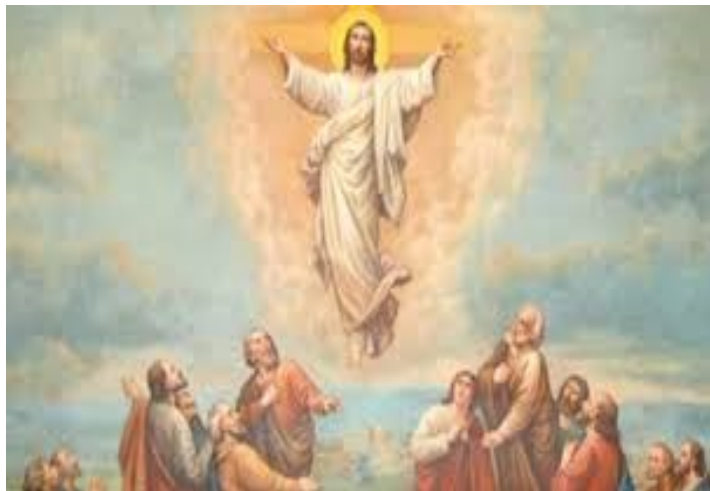
The Ascension of the Lord